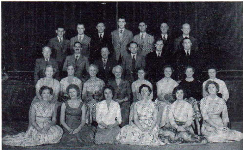
MEMBERS OF THE CHORUS