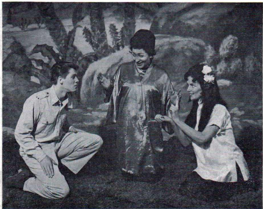
“ Happy Talk ”