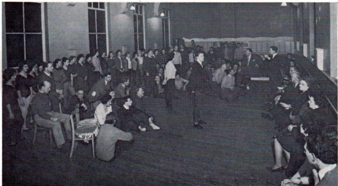
Company at Rehearsal